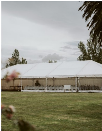
TABLE OF INSPIRATION